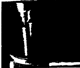
Fig. No. 3