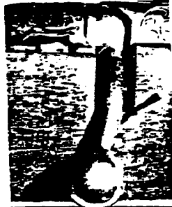
Fig. No. 8