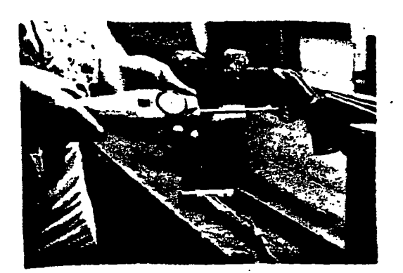
Figure 4 - 13