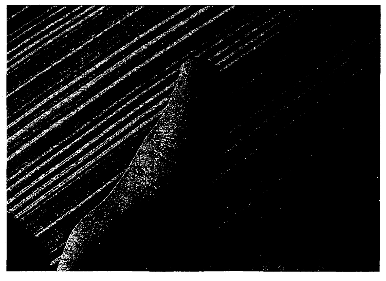
BARBER - Kinzer PPS GAL RE0008562