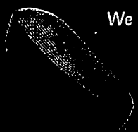
R2 REMINGTON RECOIL PAD

line at (800) 537-2278 with your questions and needs or visit our web site at www.remington.com for detailed product descriptions, answers to the most frequently asked questions and the latest corporate news.