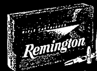
PREMIER® CORE-LOKT® ULTRA

The Remington PR team is committed to helping you by providing prompt and factual product information, photography and technical support along with a product evaluation program.