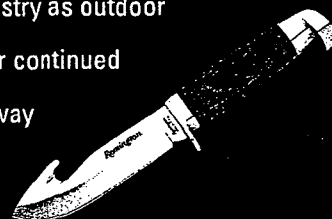
BIRDS-EYE MAPLE FIXED BLADE KNIVES