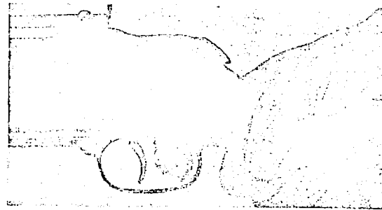
To operate the double-set trigger on the Tradewinds , you first pull the rear trigger hard. That sets the front trigger for a light pull. As on most models, trigger pull is adjustable.

The sportsman who displays his guns in a rack or on a wall will want a rifle that is as good in looks as in performance. Some models are offered in several "grades," or price lines that differ from each other chiefly in finish and