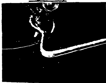
Fig. No. 9