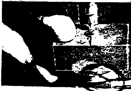
Fig. No. 3