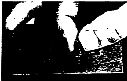
Fig. No. 2