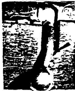
Fig. No. 8