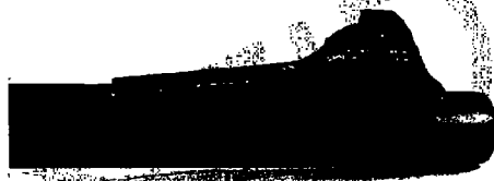
Location where Front Sights came loose in Base

None of the 9 guns tested during this test had any part of either the front or rear sight come loose. All testing was shot from the shooting jacks in the short range and the procedure documented in the Test Plan was followed.