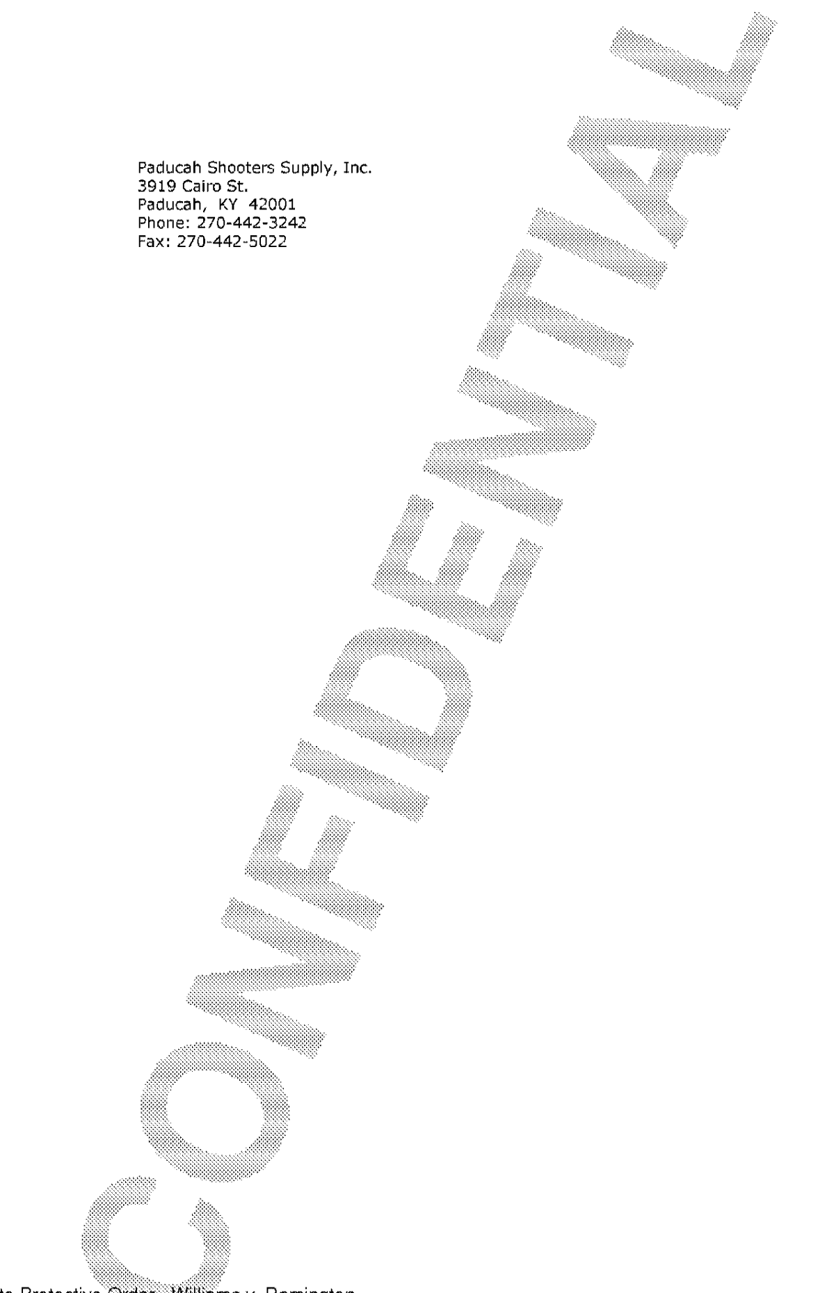
Subject to Protective Order - Williams v. Remington