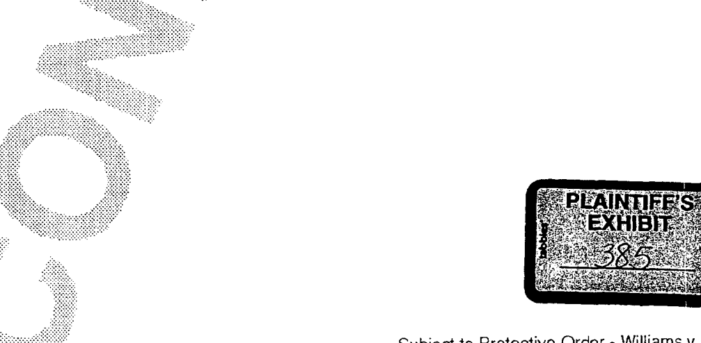
Subject to Protective Order - Williams v. Remington