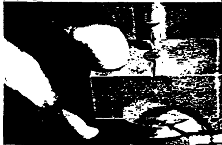
Fig. No. 3