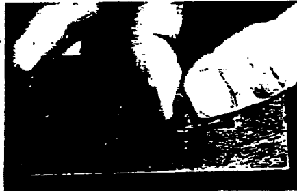
Fig. No. 2