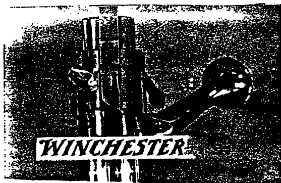
Fig. No. 9