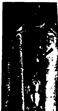
Fig. No. 6