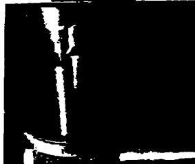
Fig. No. 3