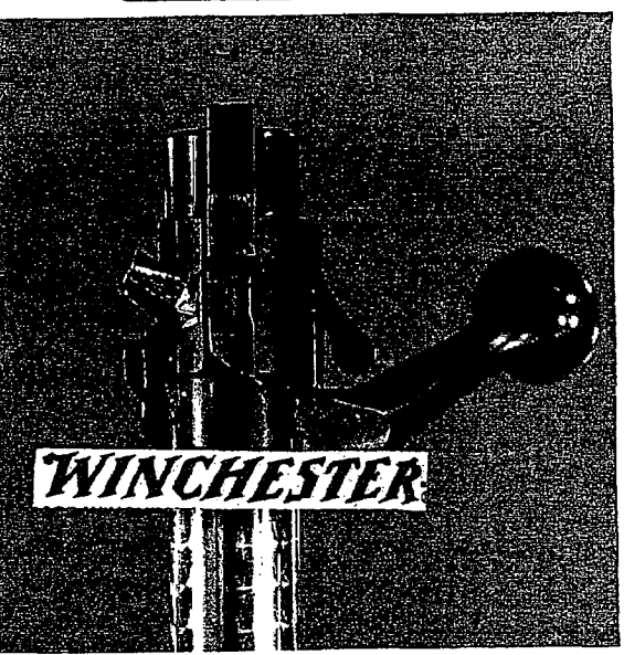
Fig. No. 9

The slot in the breech bolt sleeve is .010" oversized. This allows the firing pin head to be sloppy in the slot. This added to the cocking problem. (Fig. No. 9)