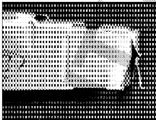
Figure 2. Image of a magazine box, which did not fail the welds, but did fail the magazine box material during the weld strength testing process.

Remington Arms Company Inc. RESEARCH & DEVELOPMENT TECHNICAL CENTER 315 WEST RING ROAD ELIZABETHTOWN, KY 42701