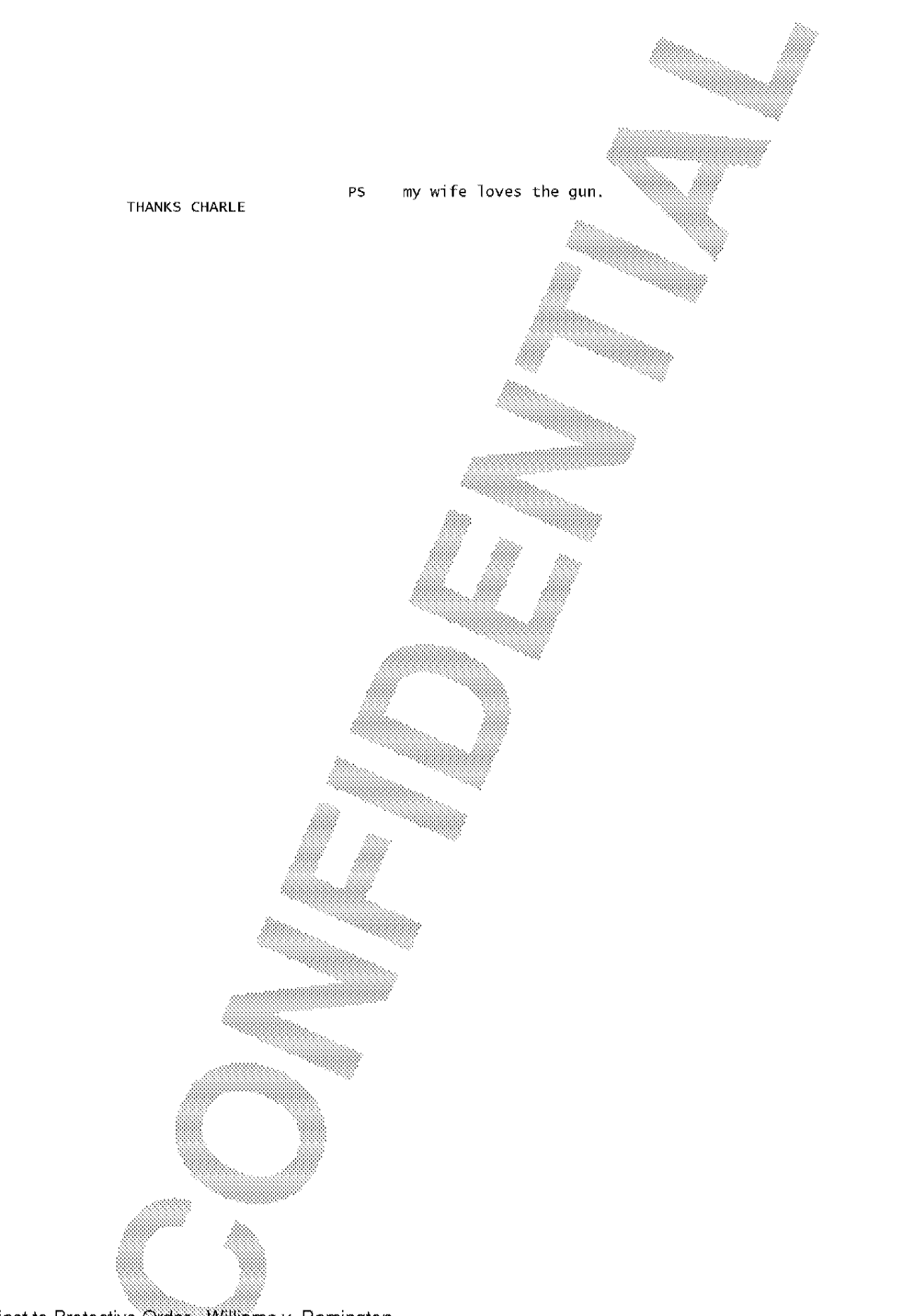
Subject to Protective Order - Williams v. Remington